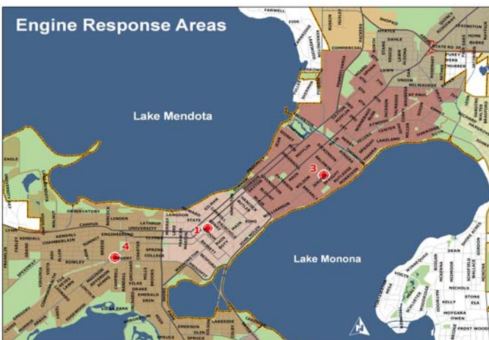
This map depicts fire engine response areas for Madison, Wisconsin

The community is better served through the use of FireView™ because discernable patterns can be identified and as a result additional resources can be focused where they are needed most. With tools such as First Due, Response Comparison and Station Analysis existing deployment strategies can be assessed and adjusted as needed. Madison Fire Department's progressive and proactive approach will benefit public safety throughout the city.