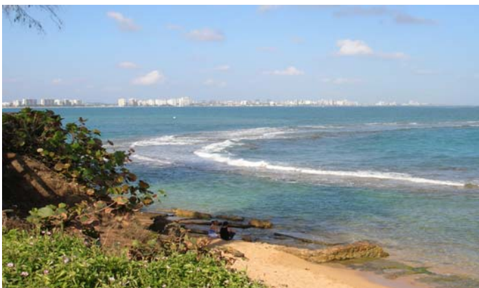
San Juan as seen from Laguna Torecilla

The Omega Group and Geographic Mapping Technologies have built a CrimeView ® application for the City of San Juan, Puerto Rico. The system is being used primarily to track Part 1 Crimes by neighborhood so that officers can be allocated where they are most needed. San Juan has eleven police precincts which serve a population of over half a million residents. The system is in place and could eventually be expanded